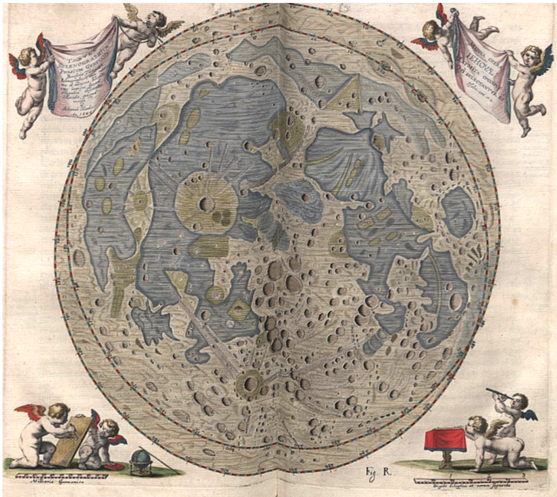
Map of the Moon engraved by the astronomer Johannes Hevelius, 1645.