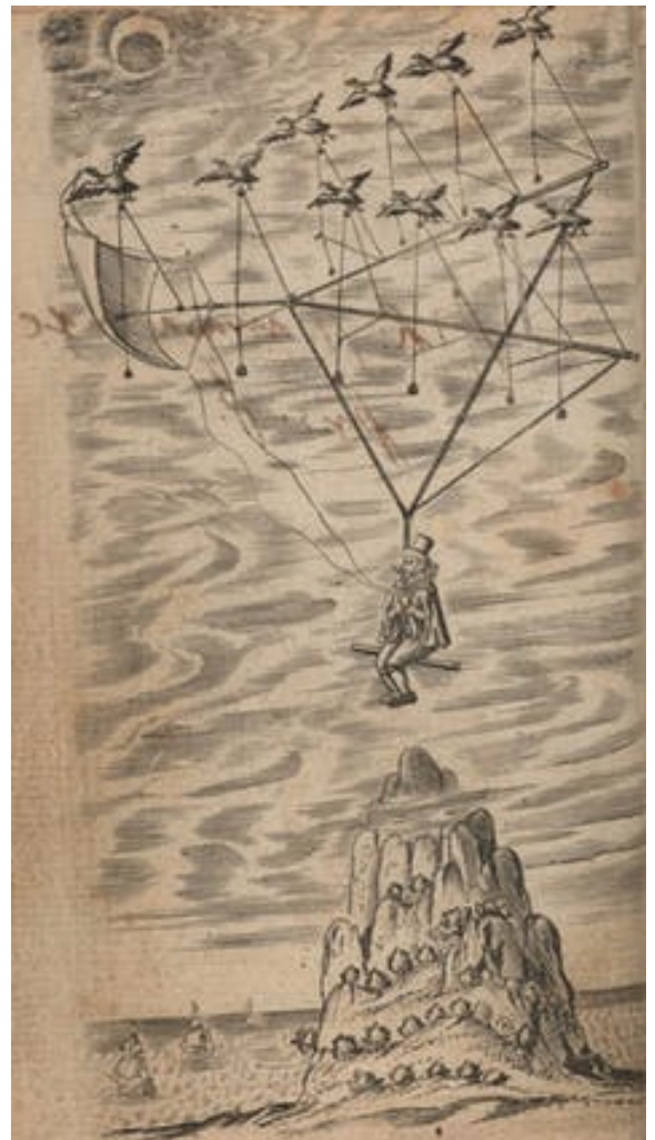
Frontispiece from The Man in the Moone , Francis Godwin (1562-1633). Houghton Library, Harvard University

Appreciating various fictional scenarios, Wilkins aimed to "raise up some spirits eminent for new attempts and strange inventions" and to contemplate practical ways of "bringing the moon closer" by travelling through space. In the pragmatic tone of an artisan, the second edition of the Discovery ruminates on the technicalities: "